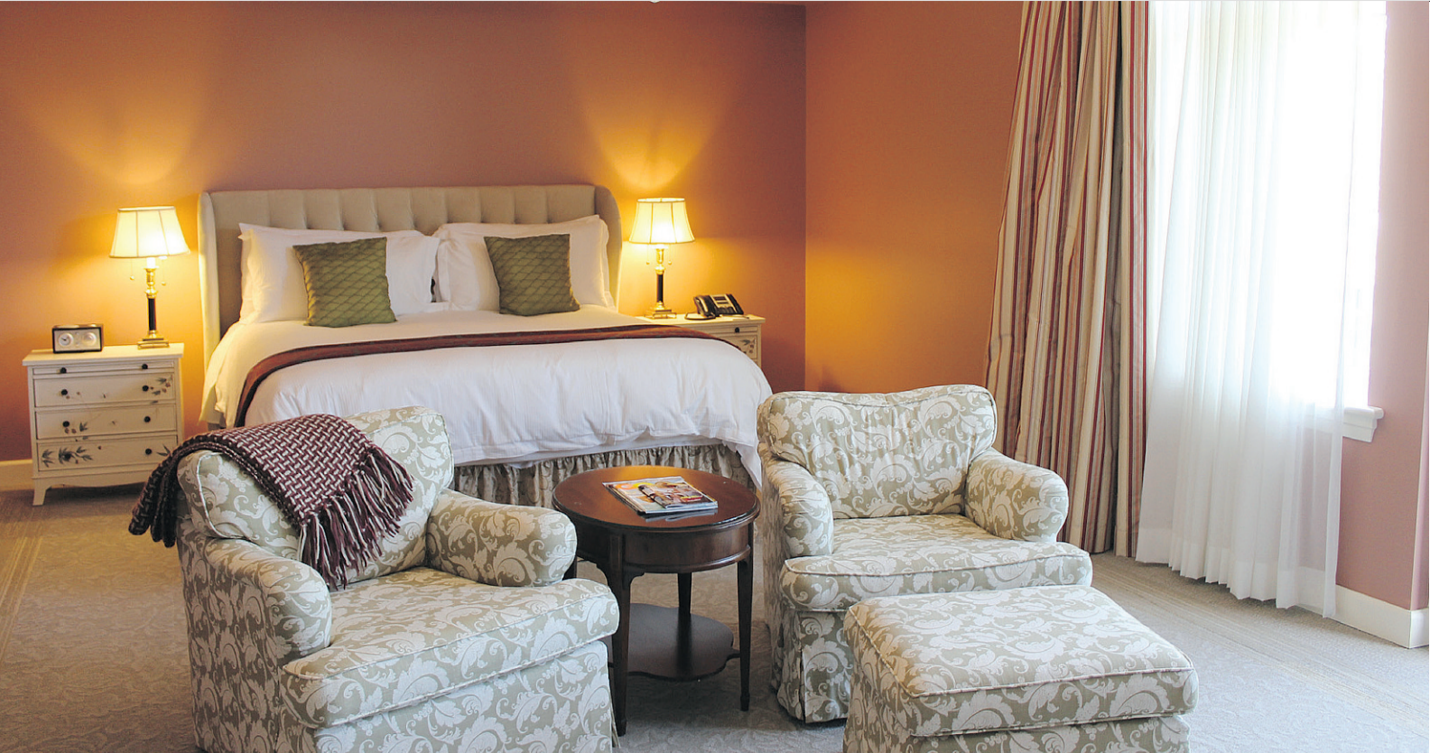
The Bruce Hotel, in Canada's most renowned theatre town, is a five-minute walk to the Stratford Festival's main stage.