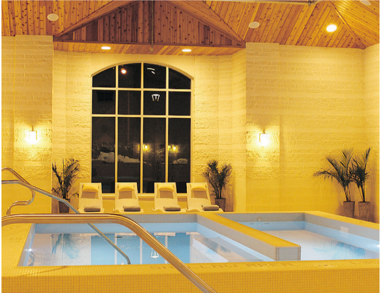
Everything about The Bruce feels spacious, because the hotel was designed to be 100 per cent wheelchair accessible.